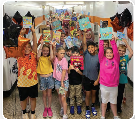
The 2024-25 second-grade class after the grand opening of the Book Vending Machine.